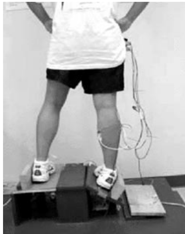
Figure 1 Trap door platform used to produce sudden inversion.

After the pretest, subjects were randomly assigned to one of the three treatment conditions: semi-rigid (n = 6), lace up