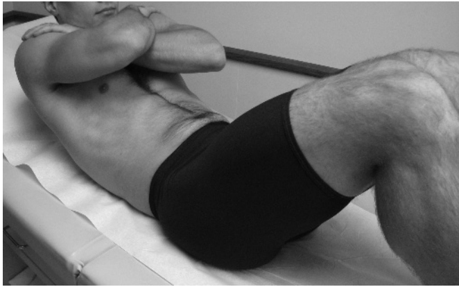
Figure 3 Demonstration of an abdominal crunch. This image was staged for demonstration purposes and does not include patient information.

One of the most important things to realise about injuries to the lateral collateral ligament is that, when it is completely torn, it usually does not heal. 5 6 Thus it is almost exactly opposite in its natural healing history from medial knee injuries, which almost always heal. Therefore it is important to determine if there is a complete tear of this ligament using a good clinical examination, stress radiographs and MRI scans. 7 Complete tears need to be monitored very closely and operated on within the first 2–3 weeks after injury if they do not show evidence of healing.