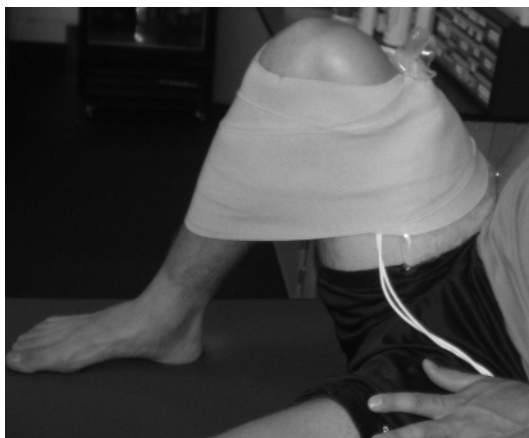
Figure 1 Original treatment for a quadriceps contusion. An ice bag is applied over the contusion and a compression wrap is applied to the maximally flexed right knee. This image was staged for demonstration purposes and does not include patient information.

The initial treatment for AC joint separations is to place ice over the AC joint immediately to minimise bleeding and swelling. We also use a shoulder sling for comfort to support