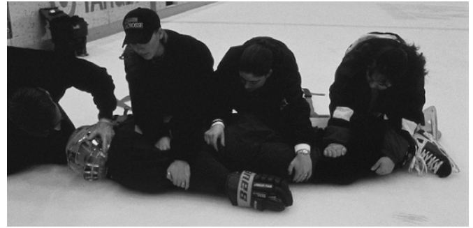
Figure 4 Correct technique for log rolling an injured athlete on the ice to place them on a spine board. This image was staged for demonstration purposes and does not include patient information.

Ice hockey is one of the few sports that can usually be played by an athlete with an ACL tear with minimal chance of injuring the knee further. It is not unreasonable for someone with minimal instability from an ACL tear and no other associated knee injuries to try to rehabilitate their knee and attempt to return to skating to complete the season. However, for skaters found to have significant instability on physical examination or with meniscal tears, we recommend that the ACL be reconstructed to protect the knee before any further intra-articular damage can occur. The issue of whether to use a