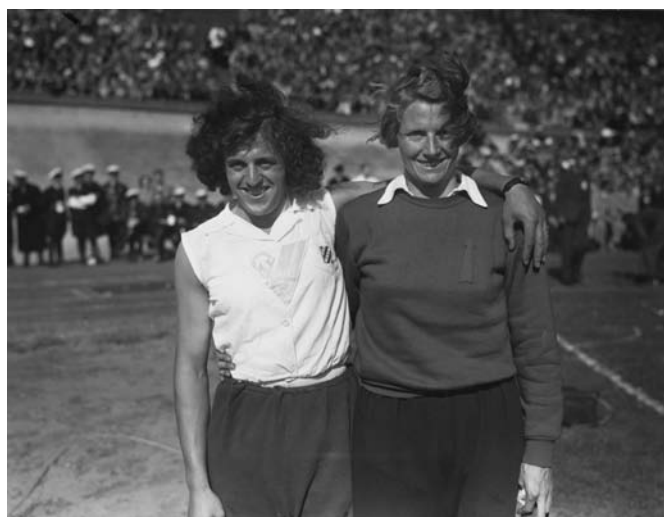
Figure 1 Foekje Dillema (in white shirt on the left) together with Fanny Blankers-Koen, on the Olympic Day, 18 June 1950, in the Olympic Stadium, Amsterdam, when 60 000 spectators witnessed Dillema winning the 200 m in 24.1 s, in a race in which Blankers-Koen did not participate. 1