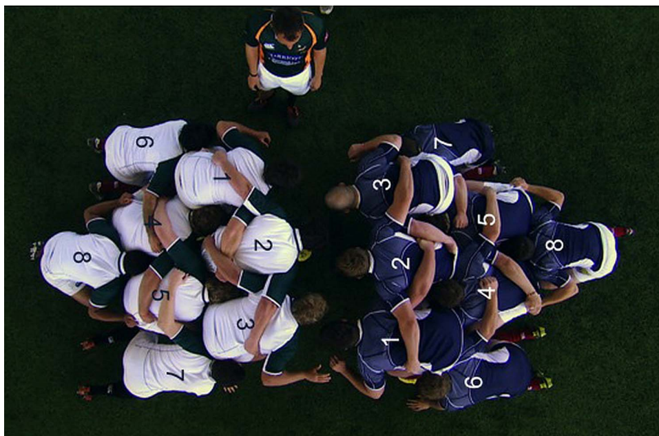
Figure 1 Scrum formation before engagement. Players 1, 2 and 3—front row. Players 4 and 5—second row. Players 6, 7 and 8—loose forward.

the BokSmart programme over the preceding 4 years (2008–2011). 1 The purpose of this paper is to describe the scrum-related catastrophic injury data in South Africa over the past 5 years (2008–2012), and to discuss how this evidence justifies the change in the Amateur Scrum Laws to make this aspect of the game safer in South Africa.