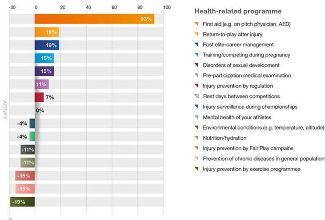
Figure 3 The percentage change in the number of IF with health-related programmes, guidelines and/or research activities from 2012 to 2016. IF, international sports federation.

‘Health of the general population’ was identified as the second lowest priority for the IFs, and only three IFs identified activities directed towards ‘Prevention of chronic diseases in the general