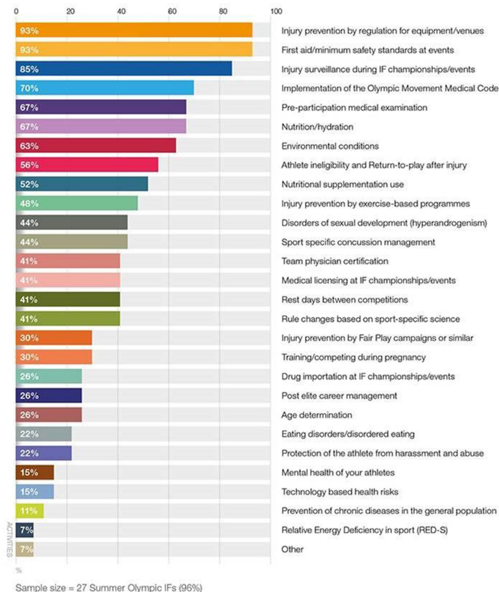
Figure 2 Percentage of international sports federation health-related programmes, guidelines or research activities.

disease in the general population ', which was specified by only two IFs.