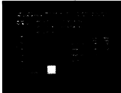
Exercise biofeedback screen

The Cybex 340 offers a new standard in Isokinetic Technology. The heart of the 340 is a powerful computer which allows patient data storage and quick computerised interpretation of all test results.