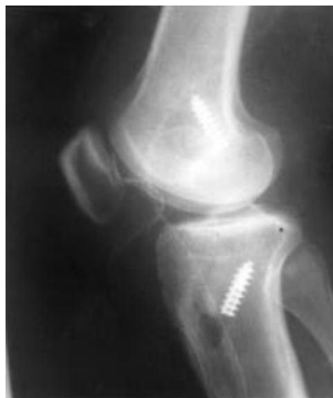
Figure 1 Lateral radiograph of the knee showing two interference screws used to secure a patella tendon graft in reconstruction of the anterior cruciate ligament.

Use of combined semitendinosus and gracilis tendon grafts for reconstruction of ACL has also been well established. Their stiffness characteristics mimic the normal ACL more closely than the stiffer patellar tendon graft. Multiple strands of the hamstring grafts may allow a better opportunity for revascularisation. They offer an alternative in skeletally immature patients (where harvesting patellar graft would jeopardise the tibial apophysis), in women for cosmetic reasons or in patients with extensor mechanism pathology. Hamstring harvest is associated with minimal graft site morbidity. 13 Both direct and indirect clinical comparisons have shown that B-PT-B grafts and hamstring grafts have similar rates of effectiveness in adults with only