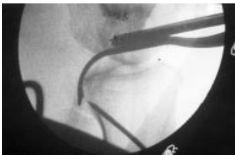
Figure 4 Intraoperative radiograph to ensure correct positioning of the tibial tunnel during reconstruction of the posterior cruciate ligament.

Acute surgical treatment of complete PCL tears can include primary repair or reconstruction depending on the location of injury. PCL reconstruction can be performed with a patellar tendon autograft, semitendinosus and gracilis autograft, or a patella or Achilles tendon allograft, and can be by open or arthroscopically assisted techniques. The arthroscopic procedure is performed with radiographic assistance (fig 4) using an additional posteromedial