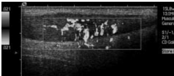
Figure 2 Neovascularisation in chronic Achilles tendinosis. Longitudinal ultrasound scan. Thickened and irregular tendon. Colour Doppler is presented; the neovessels are the coloured structures inside and at the ventral side of the Achilles tendon. The colour figure can be found at www.bjsportmed.com .

ultrasound probe was held on the dorsal side of the Achilles tendon parallel with the fibres. The injection was always from the medial side of the tendon to minimise the risk of contact with the sural nerve (fig 1). It was necessary to use colour Doppler to identify these small vessels (fig 2).