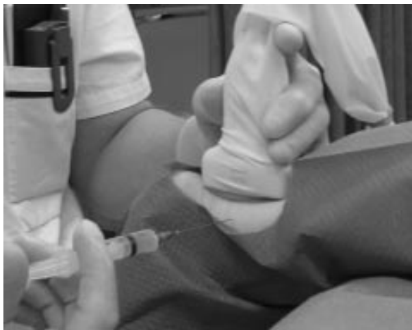
Figure 1 The sclerosing procedure. Note the position of the probe covered with a sterile rubber cover and the position of the injection needle on the medial side of the Achilles tendon.