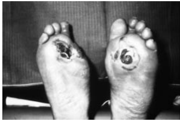
Figure 11 Bilateral painless ulcers in a patient with diabetic peripheral neuropathy.

Reflex sympathetic dystrophy is also known as algodystrophy, Sudeck's atrophy, and chronic regional pain syndrome type 1. It is characterised by localised or diffuse pain, usually with associated swelling, trophic changes, and vasomotor disturbances, 31 with impaired mobility of the affected region (figs 4 and 5). There have been difficulties with the definitions of reflex sympathetic dystrophy, and the cause, pathogenesis, and natural history are unclear. The condition may occur spontaneously, or after minimal trauma—following surgery or a fracture. Concurrent medical conditions may predispose to reflex sympathetic dystrophy, including diabetes mellitus, hyperthyroidism, hyperparathyroidism, and type IV hyperlipidaemia. 32 A variety of treatments have been used with anecdotal success, including analgesics, physiotherapy, intravenous bisphosphonates, calcitonin, oral corticosteroids, and sympathetic ganglion blocks. 32 The outcome is usually good, although some patients develop chronic pain and contractures.