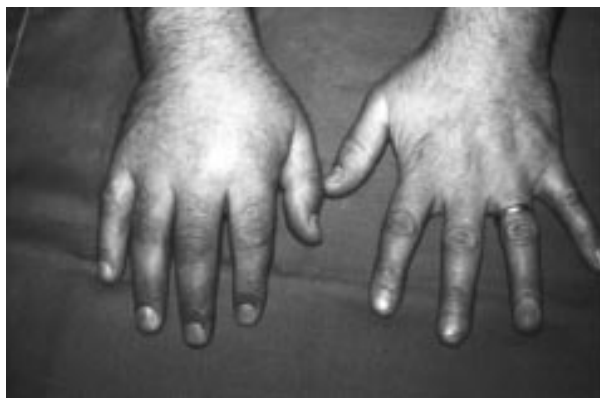
Figure 5 Hands of patient with reflex sympathetic dystrophy.