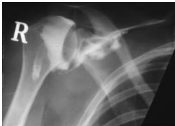
Figure 1 Shoulder arthrogram showing a contracted and adherent joint capsule in adhesive capsulitis.