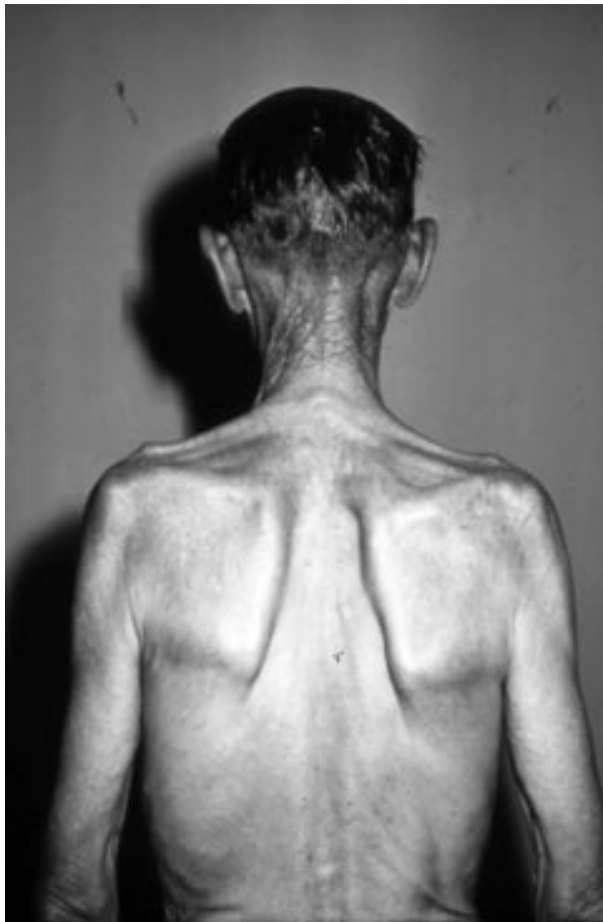
Figure 13 Diabetic amyotrophy of the shoulder girdle.

growth, and may explain the higher prevalence in type 1 compared with type 2 diabetes (ratio 3:1). 20 There may be associated pain in one third of patients who have hyperostosis of the heels or elbows. Patients with hyperostosis of the spine may have associated mild stiffness on arising in the morning, and 16% of affected persons may develop dysphagia. 14 In most cases affected persons have normal mobility of the spine and may be asymptomatic, with the diagnosis of the condition an incidental radiographic finding. 15 Estimated prevalence is 13–49% in diabetic patients 6 and 1.6–13% in non-diabetics. 20 Among patients with diffuse idiopathic skeletal hyperostosis, 12–80% have diabetes or impaired glucose tolerance. The high prevalence of abnormal glucose tolerance tests in patients with diffuse idiopathic skeletal hyperostosis is partly a result of an association with obesity, with 83% of patients being male and 30% obese. 14 Obesity and diabetes seem to have independent contributions to the development of the condition. 14