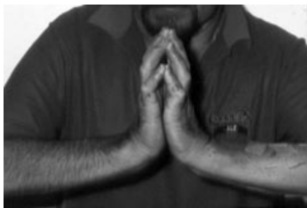
Figure 2 Limited joint mobility shown by the inability to press the two palms completely together, with the wrists maximally flexed, forming the prayer sign.