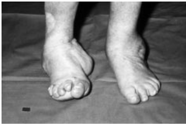
Figure 10 Joint destruction such as is seen in Charcot's disease.