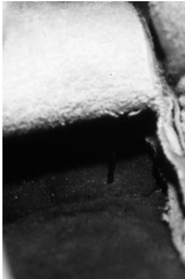
Figure 12 The nail through the sole of this slipper (see arrow) worn by a patient with diabetic peripheral neuropathy, was only noticed at the end of the day when the slipper was removed.