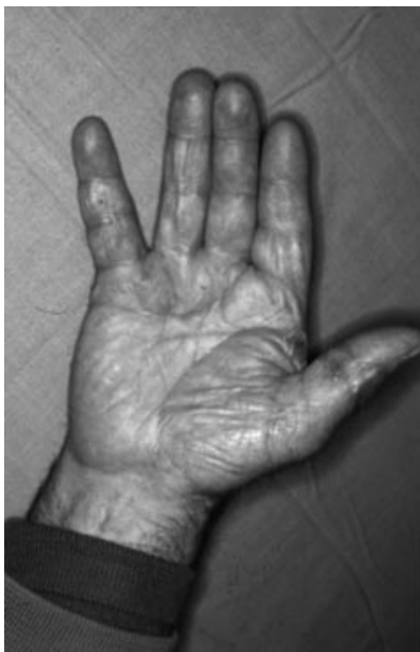
Figure 3 Dupuytren's contracture of the hand.

There is increased incidence of hand abnormalities in patients with type 1 and type 2 diabetes compared with the general population. The association between the hand abnormality and the duration of diabetes but not age or sex is a consistent finding. 12