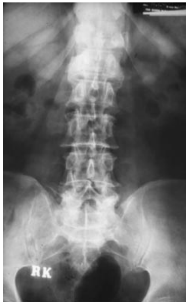
Figure 7 Radiograph (anterior view) of the lumbar spine in diffuse idiopathic skeletal hyperostosis.

Dupuytren's contracture is the palmar or digital thickening, tethering, or contracture of the hands (fig 3). In patients with diabetes, the ring and middle finger are more commonly affected, compared with the fifth finger in patients without diabetes. 19 The prevalence of Dupuytren's contracture in diabetic patients ranges from 20 to 63%, 16, 19, 20 compared with 13% in the general population. 21 Among patients with Dupuytren's contracture, 13–39% have diabetes. 19, 22 The contractures are generally milder in diabetics than in patients with Dupuytren's contracture who do not have diabetes, and the prevalence increases with advancing age. 23 Treatment consists of optimising glycaemic control, physiotherapy, and hand exercises if required, and surgery only if function is severely affected. The contractures are usually mild, however, and rarely require surgery. 6