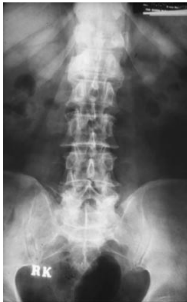
Figure 7 Radiograph (anterior view) of the lumbar spine in diffuse idiopathic skeletal hyperostosis.

Dupuytren's contracture is the palmar or digital thickening, tethering, or contracture of the hands (fig 3). In patients with diabetes, the ring and middle finger are more commonly affected, compared with the fifth finger in patients without diabetes. 19 The prevalence of Dupuytren's contracture in diabetic patients ranges from 20 to 63%, 16, 19, 20 compared with 13% in the general population. 21 Among patients with Dupuytren's contracture, 13–39% have diabetes. 19, 22 The contractures are generally milder in diabetics than in patients with Dupuytren's contracture who do not have diabetes, and the prevalence increases with advancing age. 23 Treatment consists of optimising glycaemic control, physiotherapy, and hand exercises if required, and surgery only if function is severely affected. The contractures are usually mild, however, and rarely require surgery. 6