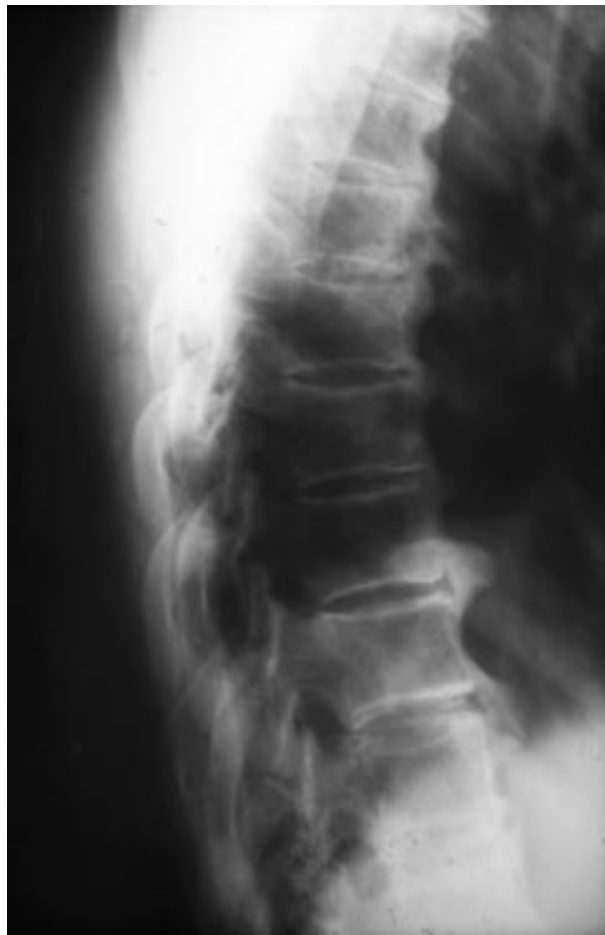
Figure 6 Radiograph (lateral view) of the thoracic spine showing flowing osteophytes in diffuse idiopathic skeletal hyperostosis.

show pronounced thickening of periarticular rather than articular collagen, which may be due to non-enzymatic glycosylation of collagen. 13