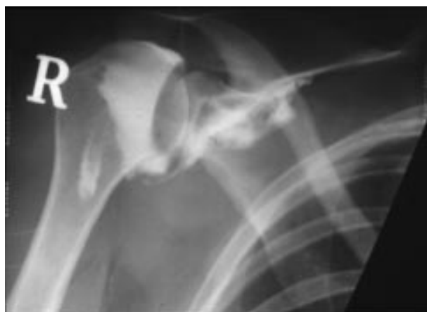
Figure 1 Shoulder arthrogram showing a contracted and adherent joint capsule in adhesive capsulitis.