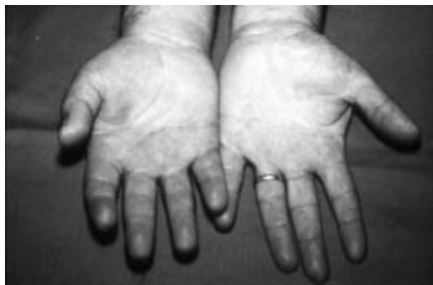
Figure 4 Hands of patient with reflex sympathetic dystrophy.

therefore blood sugar monitoring and contingency plans for elevated blood sugar levels should be considered. Distension or manipulation under anaesthesia are occasionally considered. An appropriately graded, regular physiotherapy programme should be maintained, after the painful phase, throughout the course of the condition.