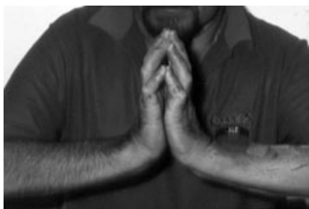
Figure 2 Limited joint mobility shown by the inability to press the two palms completely together, with the wrists maximally flexed, forming the prayer sign.