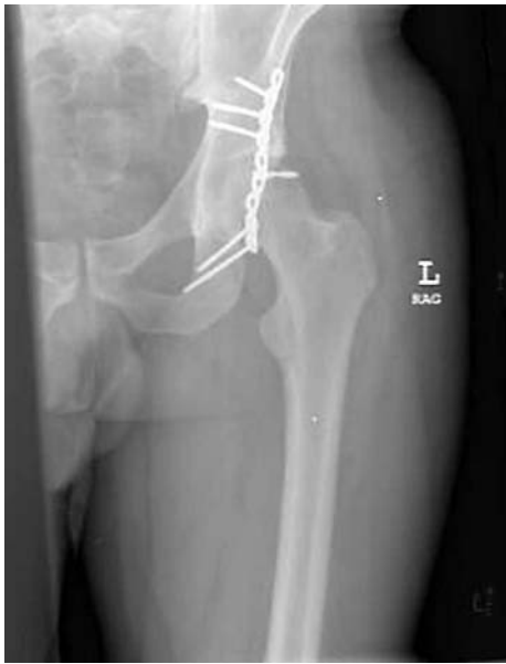
Figure 3 Anteroposterior pelvis radiograph after surgery showing fixation of the posterior wall fragment.

The patient subsequently underwent operative fixation identical with case 1. She had an uneventful postoperative course, and was only allowed touch down weight bearing for 12 weeks. At the one year follow up, the injury was clinically and radiographically healed. The patient was pain free with an SMFA score of 9.78. Examination of the hip revealed only a 5° deficit passive internal rotation compared with the uninvolved side. The patient elected not to return to play. Because of her age and sex, bone densitometry was performed to assess bone quality; the results showed normal Z and T scores.