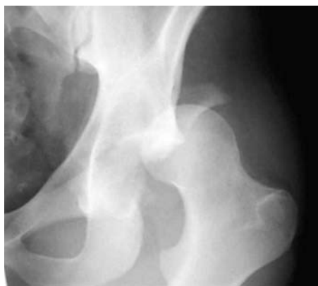
Figure 1 Left hip obturator oblique radiograph before surgery showing a posterior wall fracture of the left acetabulum.

An open reduction and internal fixation of the posterior acetabulum with a 3.5 mm reconstruction plate (fig 3) was performed using a Kocher-Langenbeck approach. The patient had an uneventful postoperative course, and was only allowed touch down weight bearing for 12 weeks. At the one year follow up, the injury was clinically and radiographically healed with a passive hip flexion of 110° and abduction of 35°. The patient was pain free and had a short musculoskeletal function assessment (SMFA) score of 5.43 (best score = 0, worst score = 100).