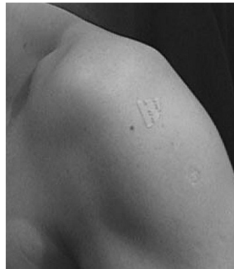
Figure 2 Application of a glyceryl trinitrate (GTN) patch to the shoulder for supraspinatus tendinosis.

In our rat model, we delivered NO via flurbiprofen, a non-specific cyclo-oxygenase inhibitor and via NO-paracetamol. In both experiments, the addition of NO had a protective or beneficial effect on collagen organisation, tendon healing failure load and stress (load/area). 16, 17 These rat results are consistent with cell culture findings for human tendon cells