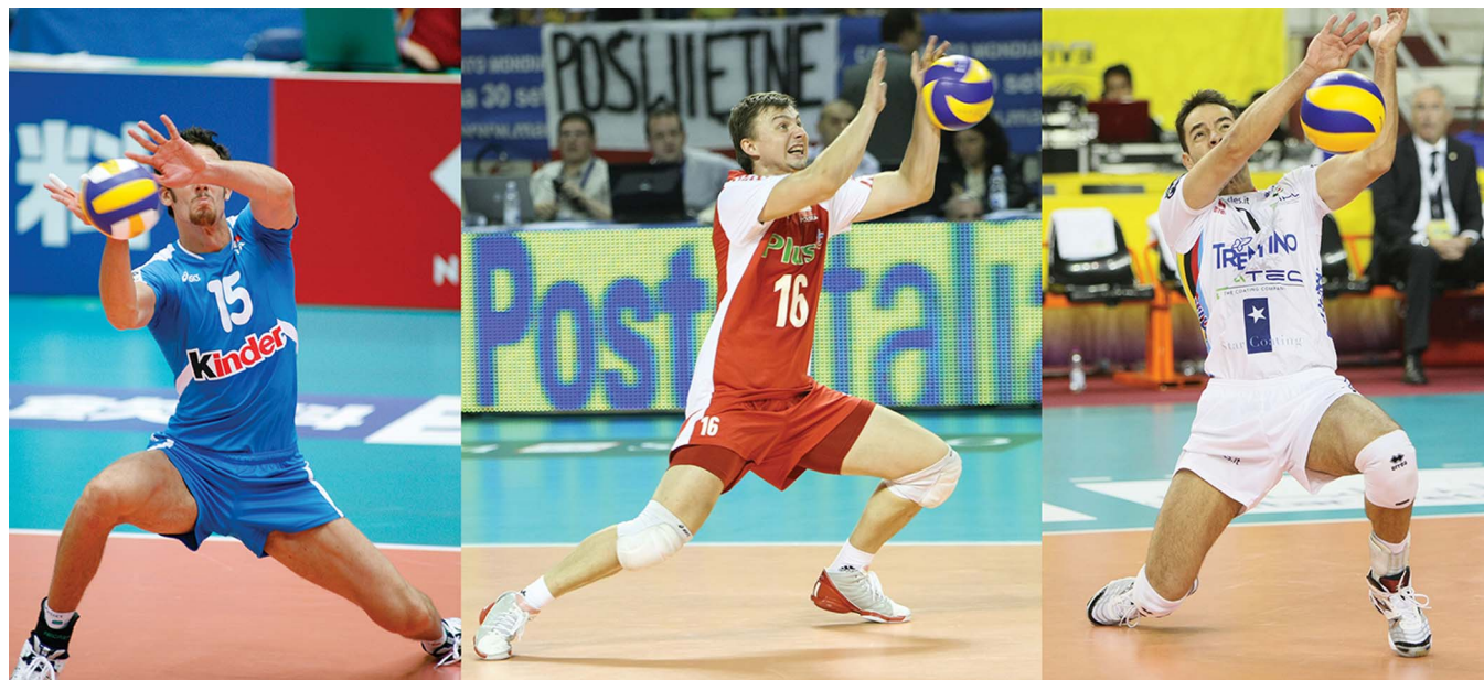
Figure 3 Overhand defensive techniques are frequently used in the back court, leading to a risk of finger injuries, particularly among libero players.

spread fingers. 15 16 However, it should be noted that rule changes have led to the development of new effective defensive techniques, the overhand dig, a common and effective defensive action used to stop hard-driven spikes in the back court (figure 3). This has been described as an additional mechanism for finger injuries in beach volleyball. 27