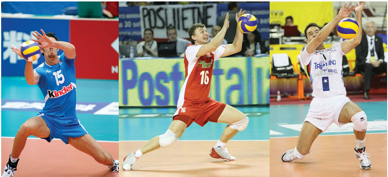
Figure 3 Overhand defensive techniques are frequently used in the back court, leading to a risk of finger injuries, particularly among libero players.

spread fingers. 15 16 However, it should be noted that rule changes have led to the development of new effective defensive techniques, the overhand dig, a common and effective defensive action used to stop hard-driven spikes in the back court (figure 3). This has been described as an additional mechanism for finger injuries in beach volleyball. 27