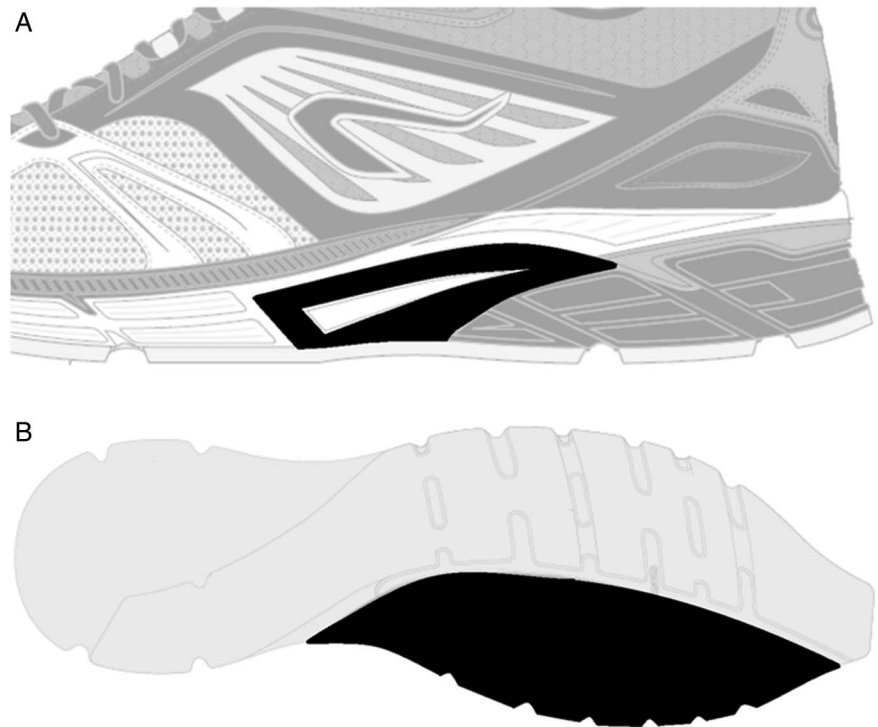
Figure 1 Illustration of the two technical features (coloured in black for illustration purposes) designed to limit the pronation movement of the runners. (A) Represents a piece of rigid plastic (thermoplastic polyurethane) located on the medial side, under the midfoot at the midsole edge. (B) Area of the harder midsole EVA (ethylene-vinyl acetate) foam. These elements were not recognisable on the shoe version distributed.

model within each strata. Significance was accepted for p < 0.05 . All analyses were performed using SPSS V.20.