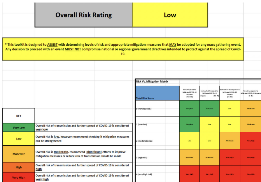
Figure 2 Risk assessment for a closed door English Premier League football match, where local transmission is reduced and risk mitigation procedures are put in place.

sport. In this editorial, we opine on what needs to be in place for professional sport to recommence.