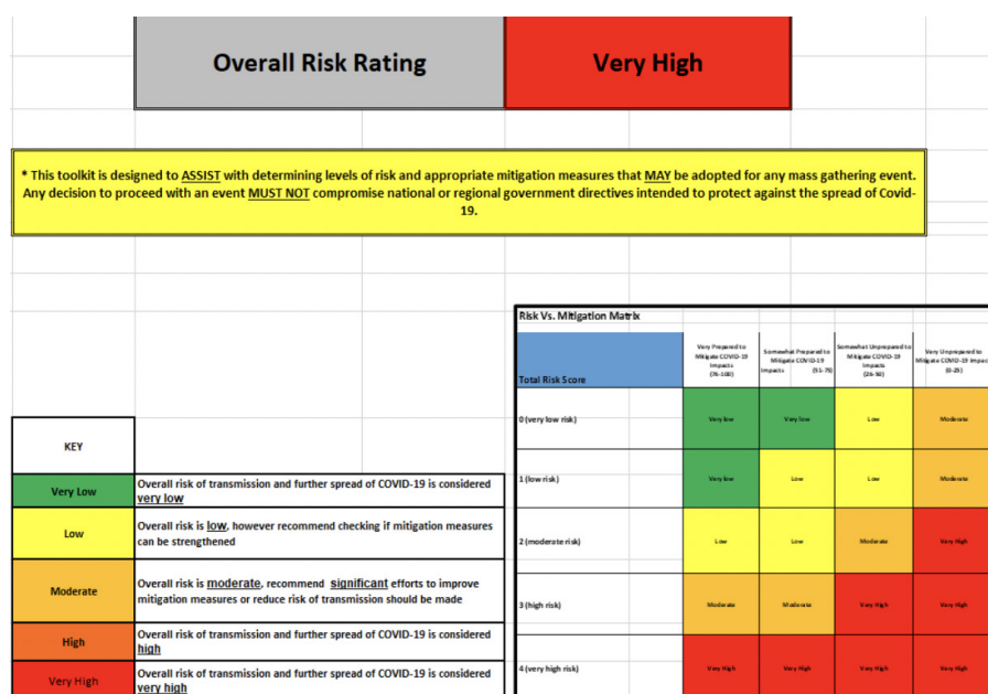
Figure 1 Risk analysis for English Premier League football hosted in April.