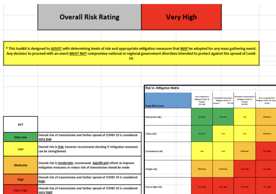
Figure 1 Risk analysis for English Premier League football hosted in April.