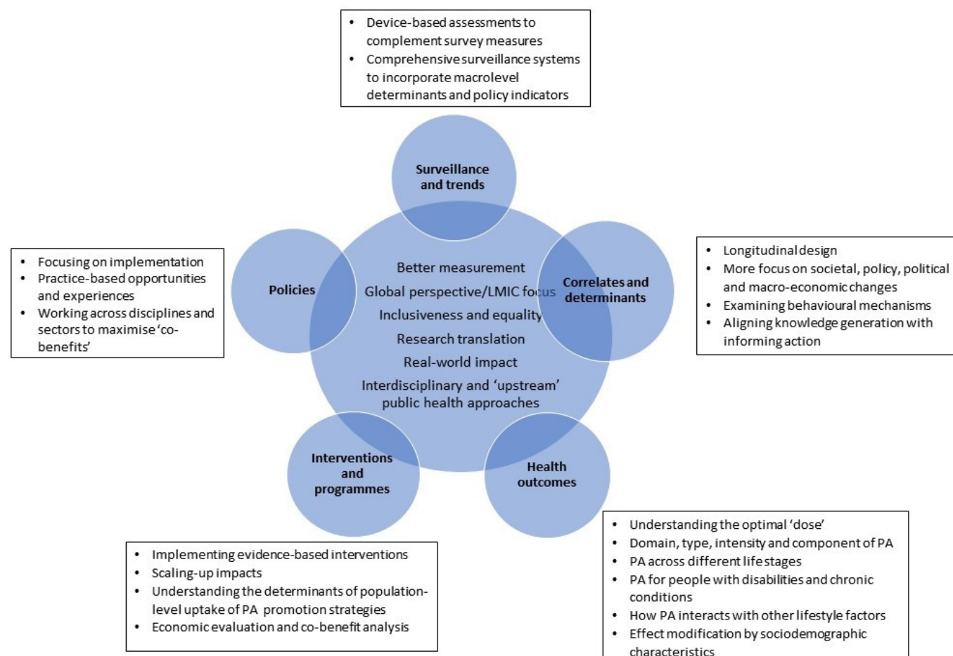
Figure 1 Recommendations for future physical activity research. LMIC, low-income and middle-income countries PA, physical activity.

Overall, despite the growing number of physical activity interventions, most published studies continue to focus on individual approaches to behavioural change, and much less research is dedicated to ‘upstream’ approaches, such as environmental and policy interventions. It has been well-acknowledged that individual behaviours are the result of multilevel influences, with environmental modifications more likely to generate far-reaching, sustainable behavioural change. 93 Based on comprehensive synthesis of empirical evidence, the Lancet physical activity series has advocated for prioritising environmental over individual approaches for physical activity promotion, and that ‘mega-trends’, such as important economic, societal, environmental and policy changes, have profound impacts on population health and offer opportunities for mobilising populations for positive changes. 94 These approaches are in line with GAPP’s policy recommendations. 8 As a working group, we have also recommended the evaluation of scaled-up physical activity interventions through multisectoral, multidisciplinary responses, 43 such as Academia da Saúde 95 and Academia das Cidades. 96 Since our call for action, there has been some promising progress in the field with more at-scale