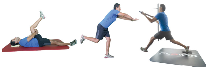
Figure 1 The lengthening exercises (in order from left to right; the extender, the diver and the slider).

The primary outcome measure was time to return to sport, defined as: ‘number of days from injury until return to full unrestricted training and/or match play’. 2 11