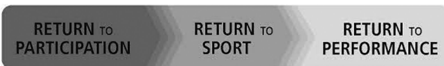
Figure 1 The three elements of the return to sport continuum. 1

††RFD 0-100 ms; average rate of force development over the first 100ms after the start of contraction - 23 % lower rate of force development in a T-position on the affected left shoulder (bold values).